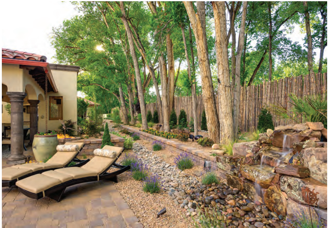
Above: Over the course of construction, Cardenas gets a feel for what the landscaping should look like and how it should flow. The approach at the Martins' home is subtle and natural, an elegant blending of the house with its surroundings.

Right: The covered outdoor kitchen brings the fun outside—and keeps grill smoke out there, too. Though the kitchen is 100 percent modern, Cardenas incorporated a pair of yellow antique doors with wide screens into its walls to continue the old world feeling found indoors.