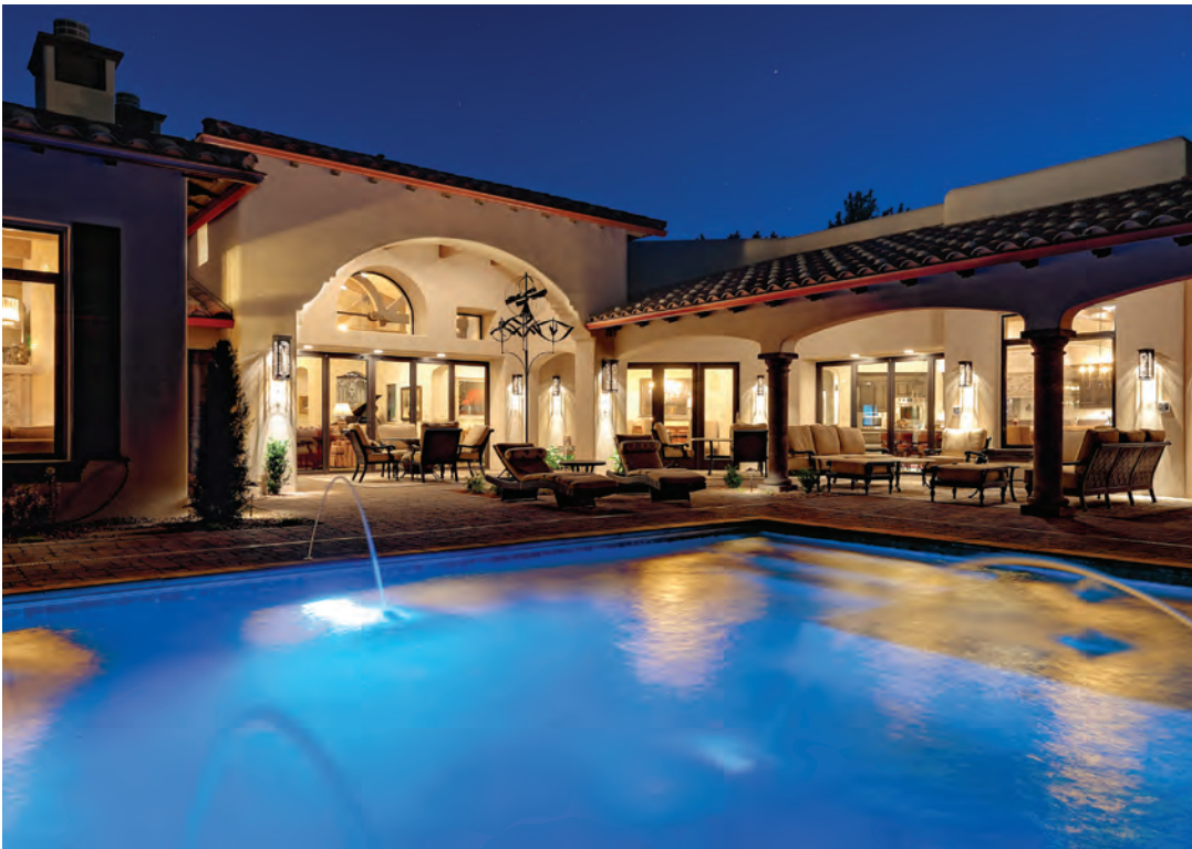
Above: Bobby and Jeri wanted space enough outdoors to comfortably accommodate large networking gatherings. Their stunning pool area, with its deep covered patio, ample covered seating, outdoor kitchen, and sliding pocket doors, is everything they had hoped.