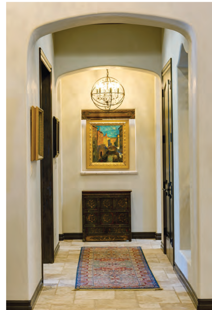
Above: Clay walls give the home its warm, old world essence, which is punctuated by antique pieces and carefully curated art.