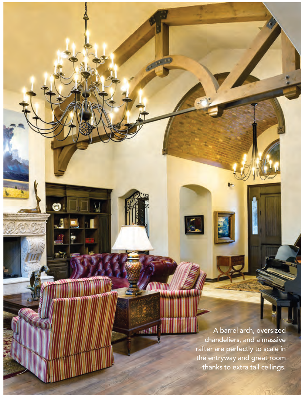
A barrel arch, oversized chandeliers, and a massive rafter are perfectly to scale in the entryway and great room thanks to extra tall ceilings.